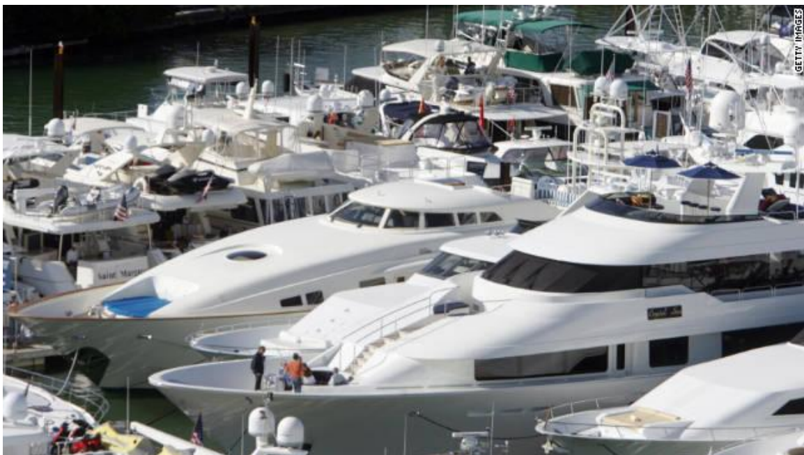
Sen. Tom Coburn says it's hard to defend mortgage interest deductions on luxury yachts, such as these lined up in Miami.

updated 9:13 AM EST, Thu December 1, 2011 ( http://www.cnn.com/2011/12/01/opinion/coburn-welfare-to-wealthy/index.html )