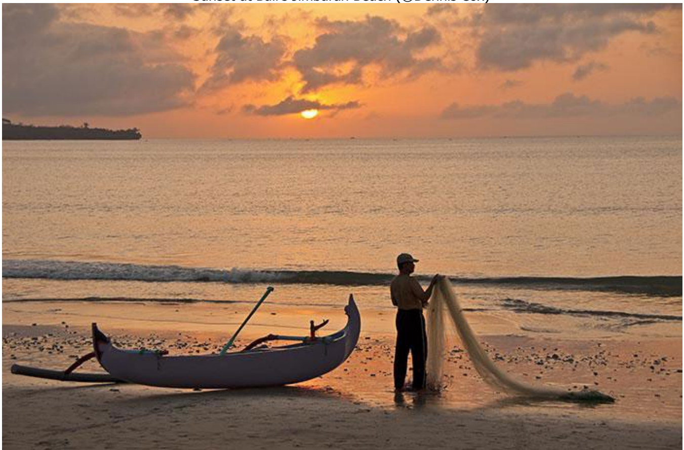
Sunset at Bali's Jimbaran Beach