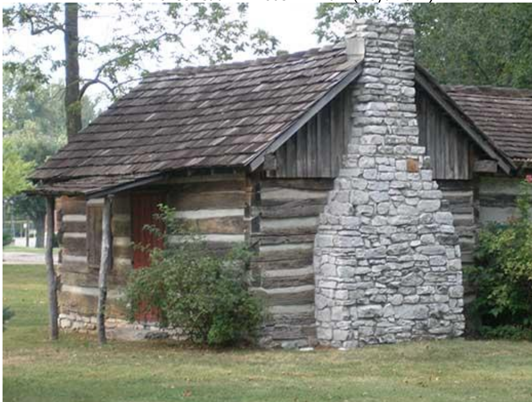
1840s Pioneer Cabin in Robe Ann Park (Lloyd Kahn)

http://lloydkahn-ongoing.blogspot.com/2008_09_14_archive.html