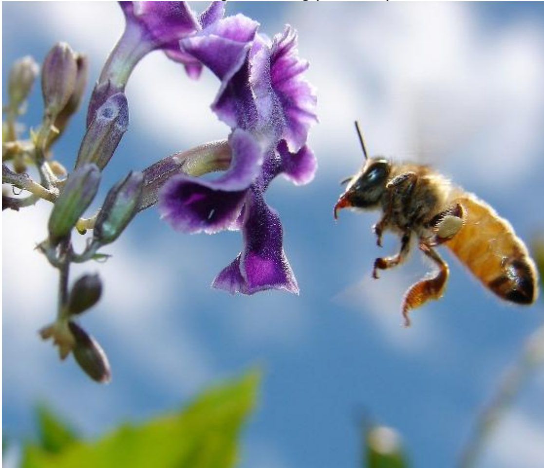
A bee doing his bee thing (thank God!)