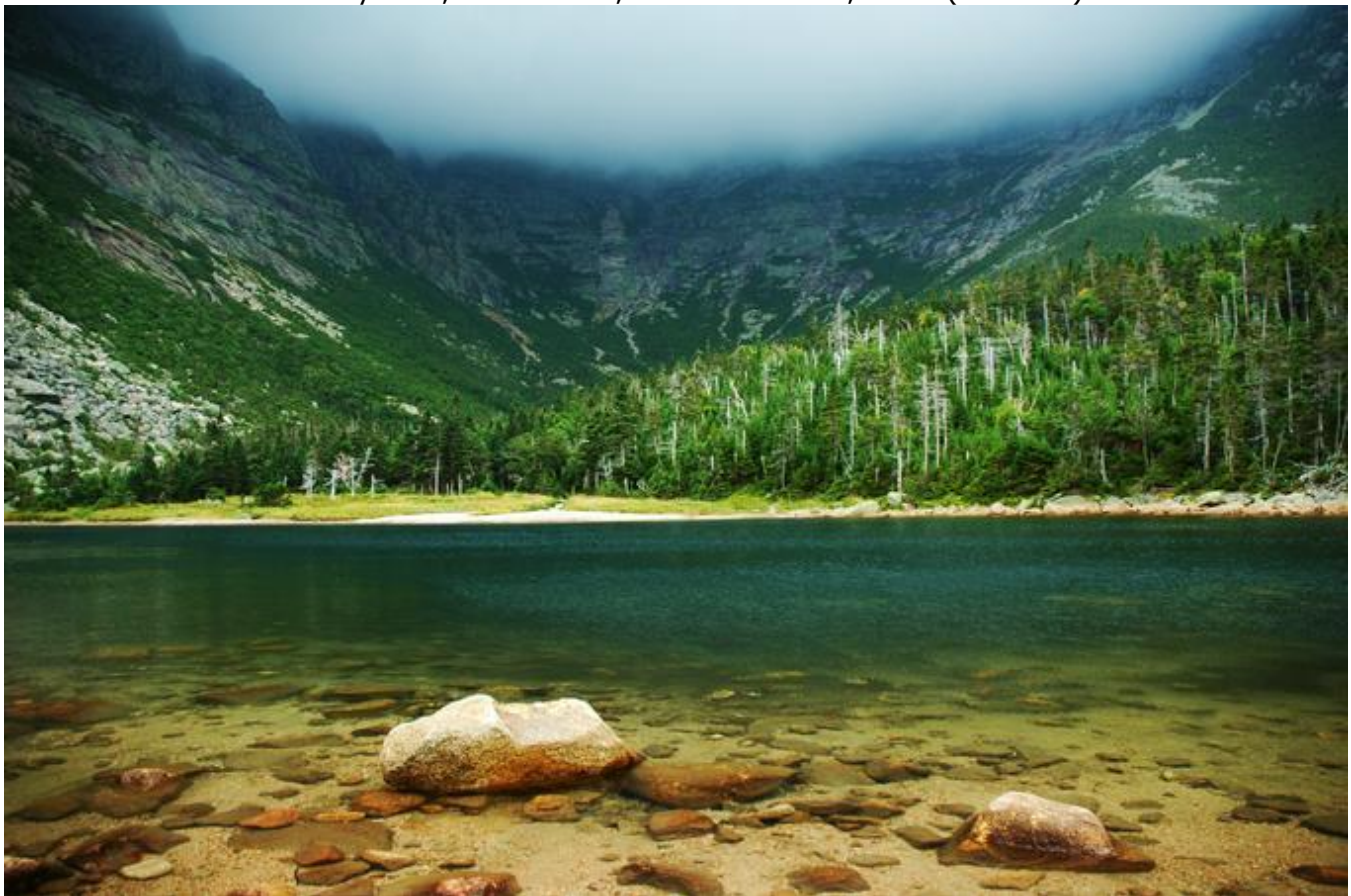
Chimney Pond, Mt. Katahdin, Baxter State Park, Maine