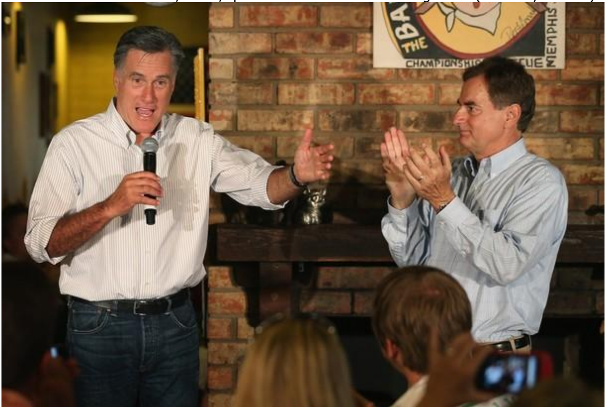
Richard Mourdock's mentor, Satan, speaks at a Mourdock fundraising cabal.