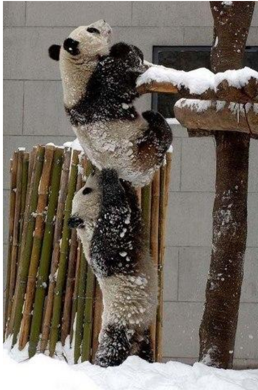
We all could use a little lift from a friend.