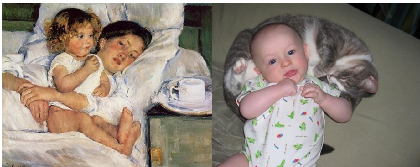
Photo: Cats Imitating Art #5 (Mary Cassatt, Breakfast in Bed , 1897)